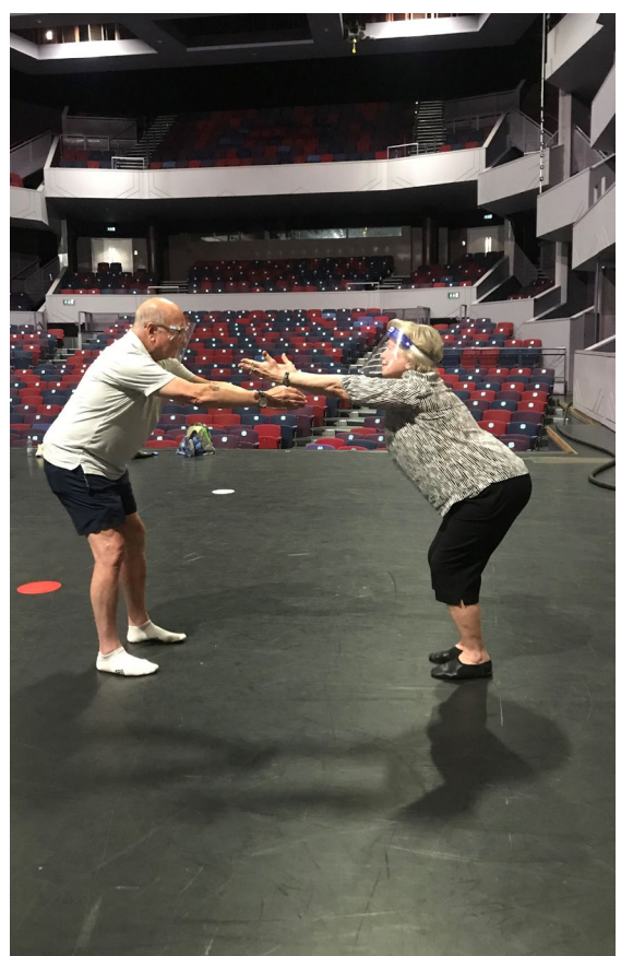
Figure 2 – The Elders' Dance Company, partner work

Further evaluation and research continues to explore the benefits and values of contemporary dance programmes for older people.